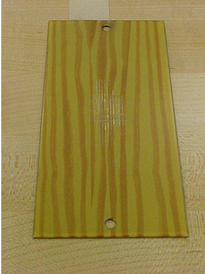
Photo No. 1 Adhesion Detail